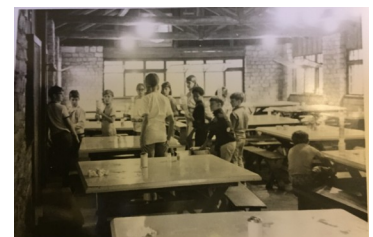
Dining Hall in the 1960s